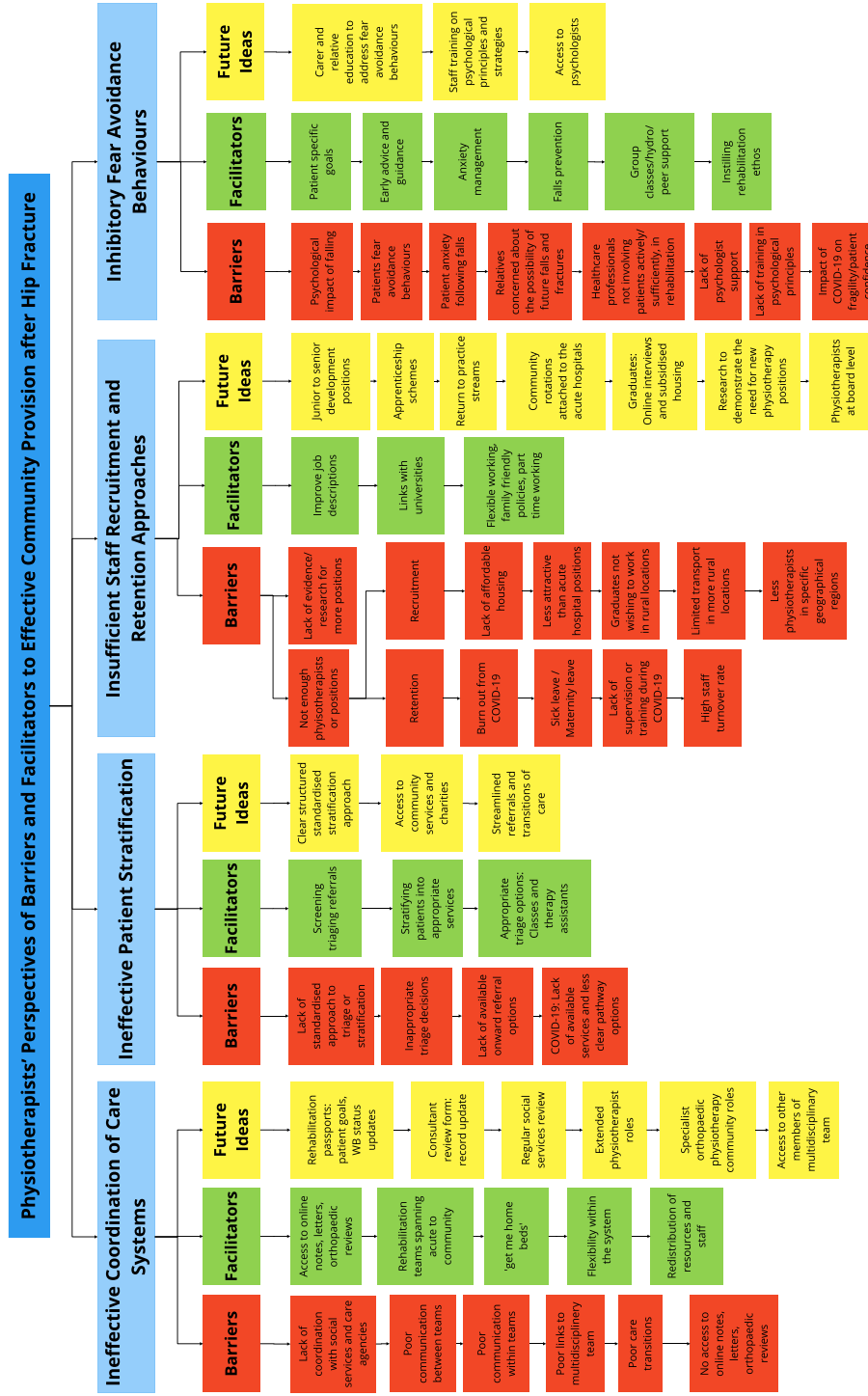
Figure 1. Coding tree. Interview data revealed 65 initial themes which were organised into four main themes summarising physiotherapists' perspectives on the provision of community physiotherapy after hip fracture: (i) ineffective coordination of care systems, (ii) ineffective patient stratification, (iii) insufficient staff recruitment and retention approaches and (iv) inhibited physiotherapy progress due to post-fall fear avoidance behaviours. Red indicates barriers, green indicates facilitators and yellow indicates future ideas for potential interventions.