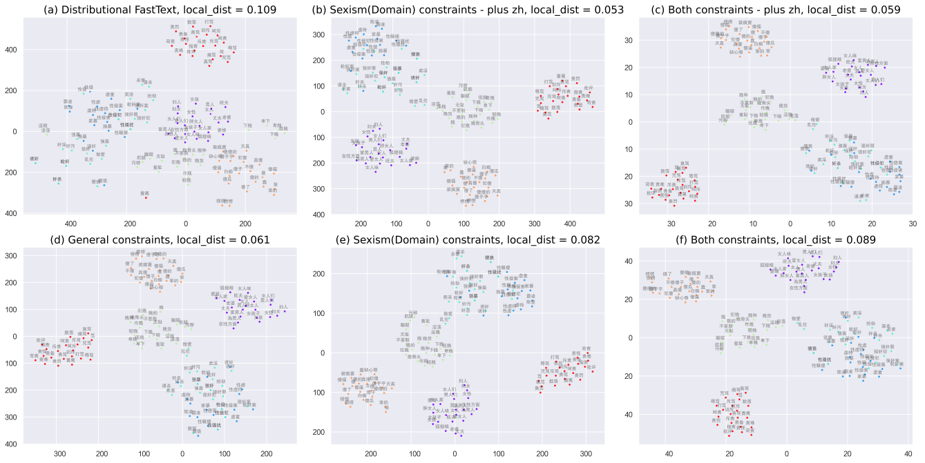
Figure 2: t-SNE visualisations of SexWES word embeddings. Each color group indicates a Chinese domain word with its 20 neighbours generated from original FASTTEXT vectors. There are totally 6 seed words selected, namely purple for 女人(woman), blue for 性侵(sexual assault), skyblue for 强奸(rape), green for 下贱(b*tchy), orange for 傻(stupid), and red for 责骂(scold). Averaged local distance of word clusters (local_dist) is measured based on the t-SNE space.

ping to full word vector space when comparing to specialised word vectors without post-specialisation step.