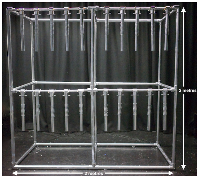
Figure 1: The study instrument is 2 metres high, 2 metres wide and features 20 performable pendulums that create 20 discrete tones.