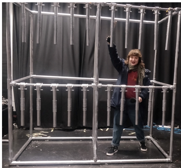
Figure 4: Three participants performed all tasks from inside the frame even though this restricted access to the other side of the instrument.

When imagining the DMI’s sound, nine of the ten participants were influenced by the instrument’s materiality such as the pendulum rings that brought to mind güiro-inspired sounds and the metallic aesthetic that evoked sounds and tonal layouts of metallic instruments. These results reinforce Pigrem et al.’s findings that performers’ expectations