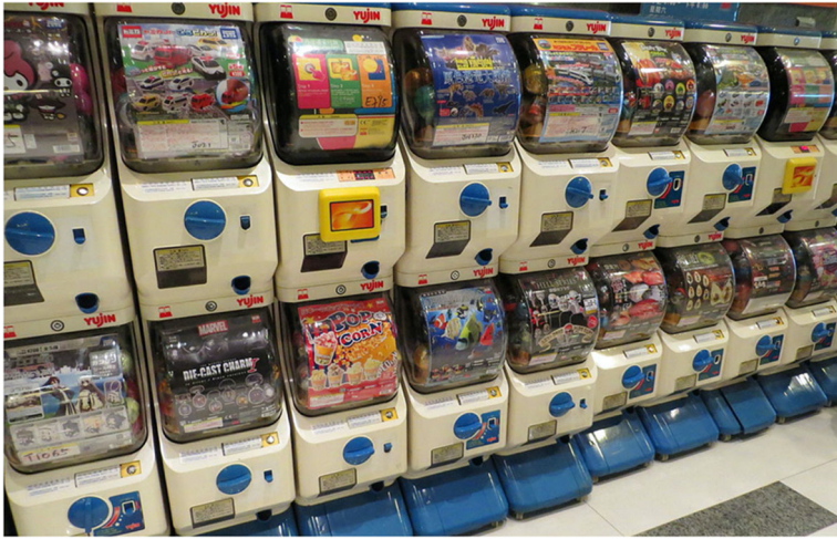
Fig. 1 Real-life Gacha machines.