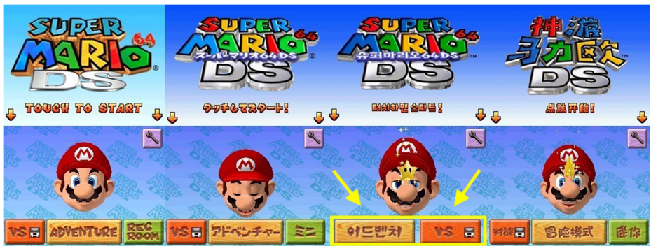
Fig. 4 Title screens of Super Mario 64 DS : from left, the International, Japanese, South Korean and Mainland Chinese versions. Notably, as annotated, the South Korean version of the game removed all simulated gambling minigames.

Nintendo DS as PEGI 3 and ‘suited for all persons’ has since rated the 2015 rerelease of the same game on the Nintendo Wii U as ‘PEGI 12 for infrequent teaching of gambling’ and therefore ‘not suitable for persons under 12 years of age.’ This example is further evidence that the potential harms of normalising gambling behaviour are being recognised and already acted upon by regulators without empirical evidence.