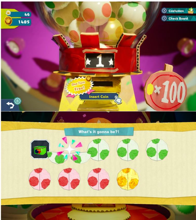
Fig. 2 Gacha in Yoshi's Crafted World . © 2019 Good-Feel and Nintendo