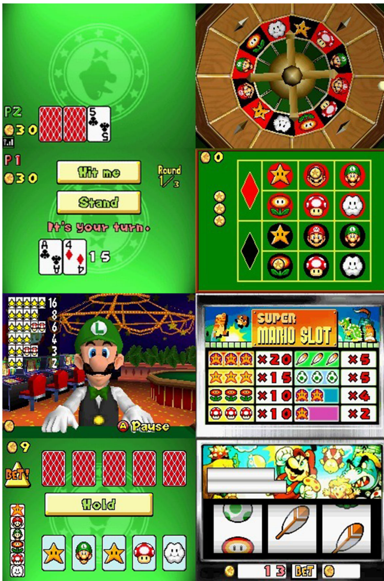
Fig. 3 Simulated gambling in Super Mario games: clockwise from top left, Luigi-Jack, Mushroom Roulette, Picture Poker and Super Mario Slot. © 2004; 2006 Nintendo

been enacted based on this theoretically logical but as yet empirically unsubstantiated regulatory basis in South Korea: the Game Rating and Administration Committee (GRAC n.d.), empowered by the Game Industry Promotion Act (Law No. 16045, 2018:art.16), prevents children below the age of 15, and restricts those under 18, from being exposed to simulated gambling content, i.e. a type of Isolated-Isolated RRM (GRAC, n.d.). As an example of compliance, Nintendo removed entirely the minigames which featured simulated gambling in Super Mario 64 DS from the South Korean release of the game (The Cutting Room Floor 2019; see Fig. 4). Similarly, in Europe, through self-regulation, PEGI (2019a), which originally rated the 2006 release of New Super Mario Bros. on the