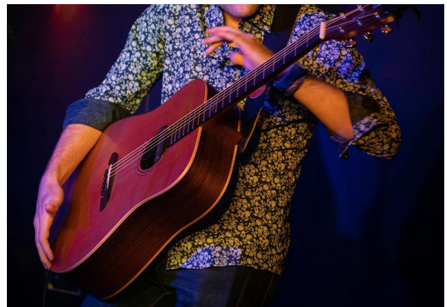
Figure 1: Example of percussive fingerstyle technique: fretting and tapping the body with the left hand over the neck.

This style was born between the 1980's and the 1990's out of the pioneering work of artists such as the late Michael Hedges; over the last decade, however, it has seen a remarkable rise in popularity and it has evolved into a community of players, mainly thanks to online media outlets. The strong visual appeal of the percussive technique is surely one of the driving factors of its success; also, the ingenuity of the arrangements has a way of inspiring guitarists and other musicians who may be inclined to experiment on their instruments beyond traditional capabilities. In fact, similar styles are already being explored on the ukulele 1 , the harp 2 and the double bass 3 .