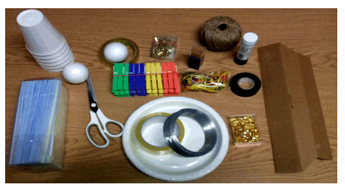
Figure 1. Workshop materials and tools: cardboard, disposable cups, paper plates, masking tape, a roll of twine, scissors, wire cutter, paper clips and pins, a roll of metal wire, plastic ball, elastic bands, straws and toothpick.

The research here presented is therefore based on the idea that "embodied making processes facilitate a different form