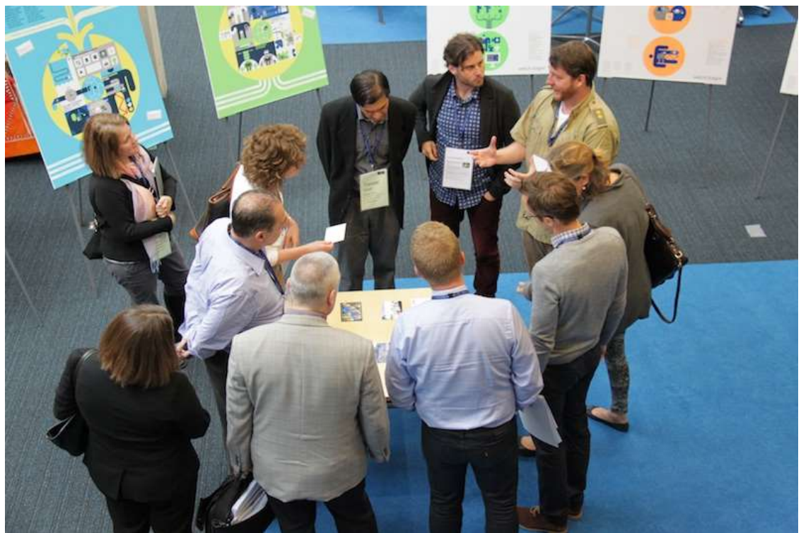
Figure 1 Installation shot showing OFF 2014 participants engaging with one another within the "Future Things" exhibition at Egrove Park, May 2014

Together the artefacts presented a range of posters, objects and digital materials that capture some of the different ways that futures are materialised in scenarios and design practice. Calling them "future things" emphasized how their "object-ness" is tied up with the practices of commissioners, creators and users of scenarios and designs. Drawing on design theorists using the term "thing" (Binder et al 2011; Latour and Weibel 2005), the title of the exhibition recognized the irony of de-contextualising objects from their contexts of production and engagement. Captured in an exhibition, many of the objects were severed from the practices they were part of, although some of the works – notably Ilona Gaynor's "Paper Moon" – are native inhabitants of exhibitions.