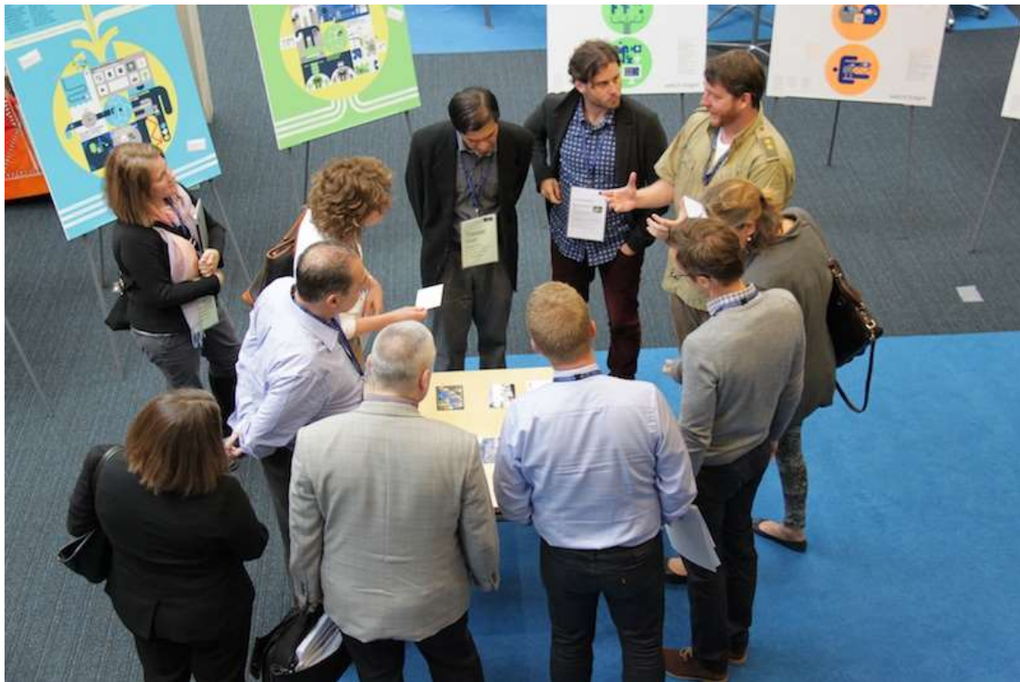
Figure 1 Installation shot showing OFF 2014 participants engaging with one another within the “Future Things” exhibition at Egrove Park, May 2014

Together the artefacts presented a range of posters, objects and digital materials that capture some of the different ways that futures are materialised in scenarios and design practice. Calling them “future things” emphasized how their “object-ness” is tied up with the practices of commissioners, creators and users of scenarios and designs. Drawing on design theorists using the term “thing” (Binder et al 2011; Latour and Weibel 2005), the title of the exhibition recognized the irony of de-contextualising objects from their contexts of production and engagement. Captured in an exhibition, many of the objects were severed from the practices they were part of, although some of the works – notably Ilona Gaynor’s “Paper Moon” – are native inhabitants of exhibitions.