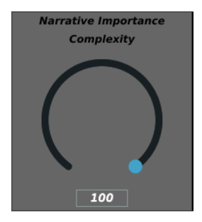
Figure 3: Screen-grab of the implemented VST effect

and how choices were made. Both found the concept easy to understand with one commenting, 'that's how I decide how loud and element should be in the mix anyway - how important