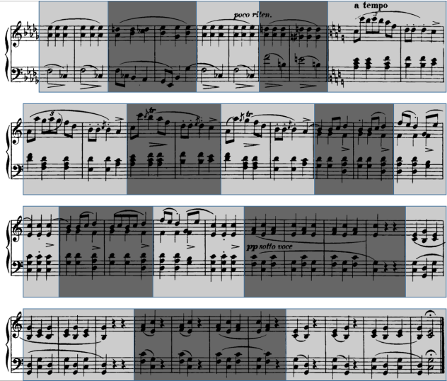
Fig. 2: Music structure analysis for phrasing of Chopin Mazurka Op.24 No.2.

Moreover, at certain positions, the performers agree on the change of tempo whereas for other positions the micro-structure of each arc differs from performer to performer. The agreed positions are usual the boundary of music structure.