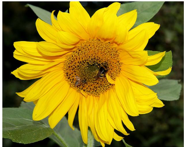
Figure 3. A bumblebee ( Bombus terrestris ) and a honeybee ( Apis mellifera ) foraging from the same sunflower inflorescence ( Helianthus annuus ). Photograph by A. Jaithirtha. doi:10.1371/journal.pone.0031444.g003

In addition to this, we also demonstrated that heterospecific cues, once they have been learnt as predictors of reward on one flower species, can facilitate the sampling of new flower species.