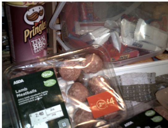
Figure 1. Collette's photograph of 'meatballs night' 'meatballs'.