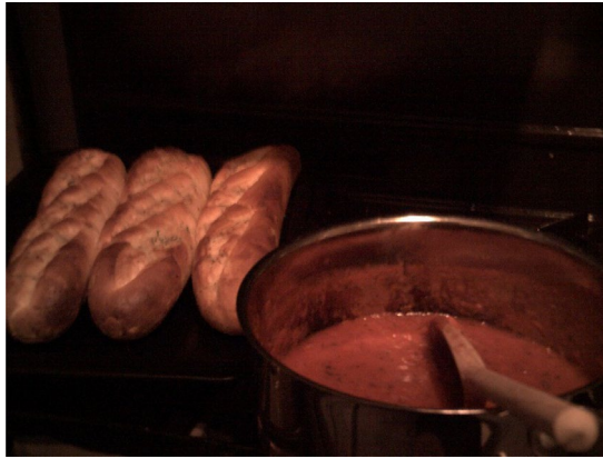
Figure 3. Collette's photograph of 'meatballs night' 'sauce and garlic bread'.