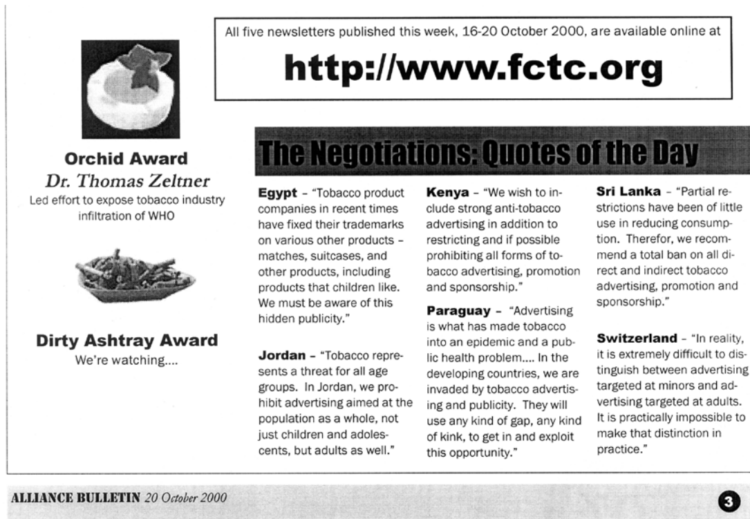
Figure 4: Orchid award and Dirty Ashtray award from the FCA's Alliance Bulletin , 2000. 111

a country willing to stand up firmly and to broker a way forward that would accommodate the needs of countries that were producers and growers, etc., and with those that weren't. 112