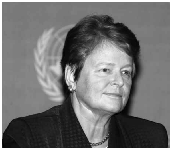
Figure 1: Dr Gro Brundtland, Director-General, WHO, 1998 to 2003.