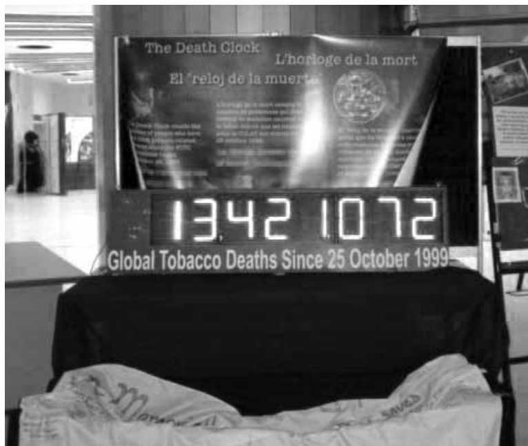
Figure 6: Death clock displayed at pre-INB-6 sessions, Geneva, February 2003.