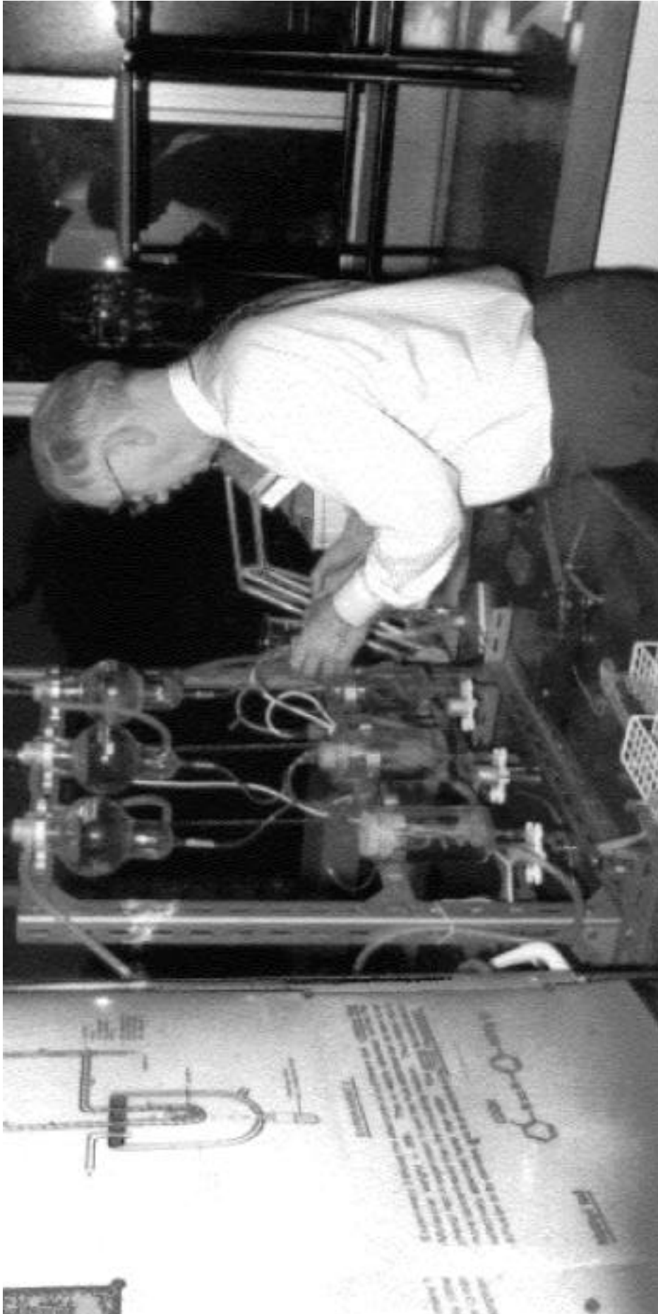
Figure 1. The late Professor R.B. Fisher setting up a demonstration of perfused small intestine at the Southampton meeting of the European Intestinal Transport Group in 1980. The apparatus here comprises three identical sets of Fisher and Parsons's apparatus modified by removal of the circulating serosal fluid. This demonstration showed the sustained absorption of fluid, but not phenol red, in the presence of luminal glucose by rat small intestine in vitro; the failure of the intestine to absorb fluid when luminal glucose was absent; and the active transport against a concentration gradient of methyl red. A key feature of this preparation was that the organ was never deprived of adequate oxygen, even momentarily, during setting up from an anaesthetized animal and subsequently.