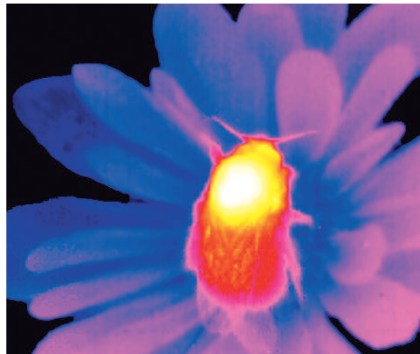
Hot spot: a thermographic image of a bumblebee taken with an infrared camera — brightness indicates higher temperature.

We conclude that the bees preferred to land on the warmer flowers, even though the similarly coloured alternative contained the same nutritional reward. In another control experiment in which flowers varied in temperature but not colour, discrimination fell to chance levels (50.8% ± 3.1 s.d.; \chi^2 = 0.3 , d.f. = 1; P = 0.64 , NS; n = 10 bees), indicating that the bees must use colour as a cue, rather