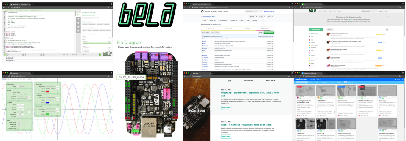
Figure 1: User interfaces to Bela. Web based IDE Editor (above left) and Scope (below left), including an interactive pin diagram (centre). Hardware peripherals and form factor are compatible with digital making practices (centre). Online community, right, consists of: open source software and hardware development, forum, blog and DMI design repository.