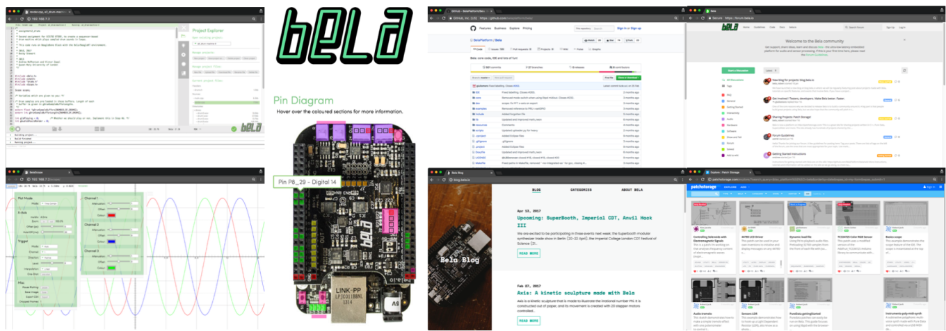
Figure 1: User interfaces to Bela. Web based IDE Editor (above left) and Scope (below left), including an interactive pin diagram (centre). Hardware peripherals and form factor are compatible with digital making practices (centre). Online community, right, consists of: open source software and hardware development, forum, blog and DMI design repository.