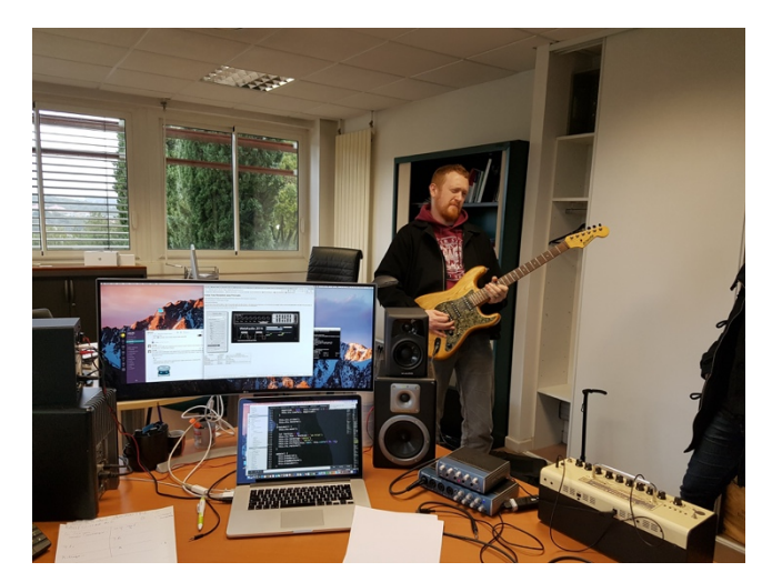
Figure 2: Typical setup for a demo / comparison with native amp simulations

We propose to present a tube guitar amplifier simulation we've been designing using the Web Audio API with the aim to faithfully reproduce the main parts of the Marshall JCM 800 amplifier schematics. Each stage of the real amp has been recreated (preamp, tone stack, reverb, power amp and speaker simulation). We've also added an extra multiband EQ. This "classic rock" amp simulation we've been building has been used in real gigs and can be favorably compared with some native amp simulation both in terms of latency, sound quality, dynamics and comfort of the guitar play. The amp is open source<sup>1</sup> and can be tested online<sup>2</sup>, even without a real guitar plugged-in. It comes with an audio player, dry guitar samples and a wave generator that can be used as inputs. Figure 1 shows the current GUI, with some optional frequency analyzers and oscilloscopes that we've been using to probe the signal at different stages of the simulation. One purpose was to evaluate the limits of the Web Audio API and see if it was possible to design a web-based guitar amp simulator that could compete with native simulations.