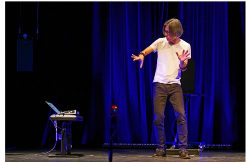
Figure 2. An interactive music performance by Atau Tanaka using two Myo armbands.

WiFi is desirable, but the demos can run offline.