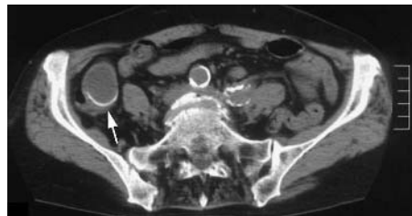
Figure 2 Computed tomography demonstrating a cystic lesion with “eggshell”-like mural calcification (arrow) in the expected region of the appendix.