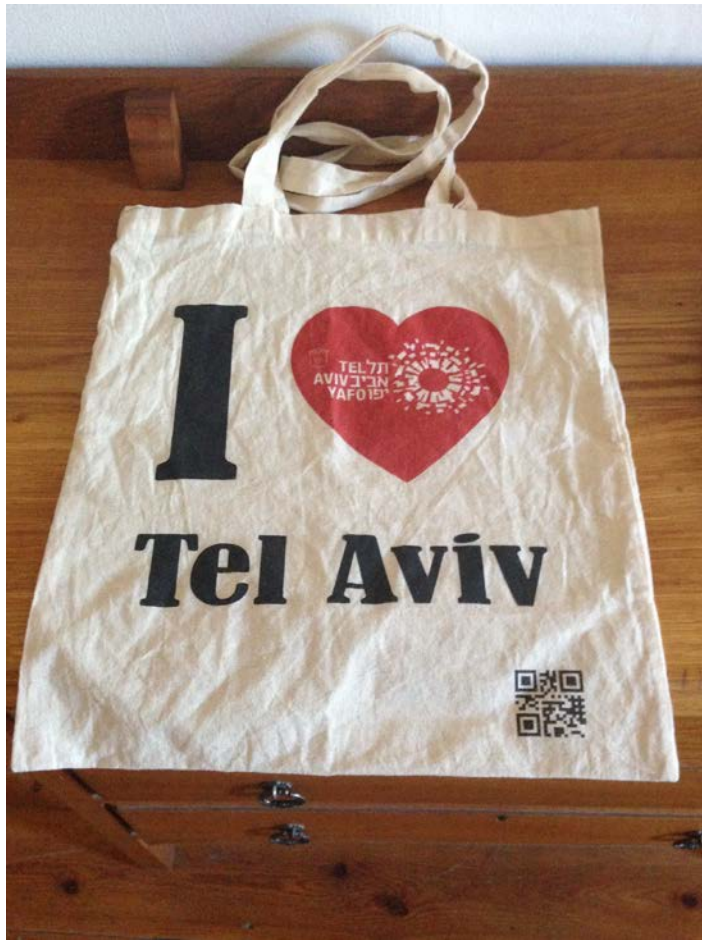
Picture 3. I love Tel Aviv bag

Positioned next to the strategic passage between the restaurant area and the main exhibitors' space, the tent of Tel Aviv could not go unnoticed by anyone who visited the park. A friendly man wearing a pink T-shirt professing love for Tel Aviv gave passers-by cloth bags (Picture 3 above) with a similar message of affection for the city and handed out leaflets promoting "Tel Aviv Nonstop City" (Picture 5 below), whilst a brawny security guard with an earphone sticking out of an open collar shirt stood nearby overseeing the interactions.