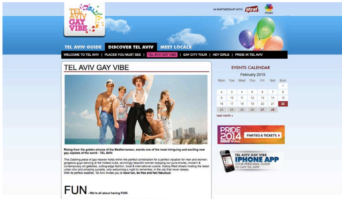
Picture 1. Tel Aviv Gay Vibe website