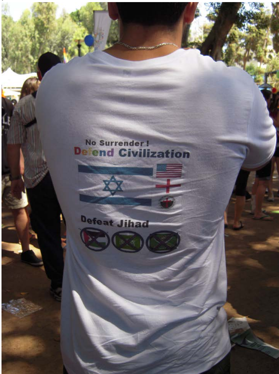
Picture 8. Ready-to-wear homonationalist politics – Tel Aviv Pride 2013

As Milani and Kapa point out, T-shirts worn at Pride events can be important material entextualisations of “ready-to-wear sexual politics” (2015: 79) in that they are used to strategically “ foreground certain nexus points of gender, sexuality and other social categories, while simultaneously backgrounding or erasing others” (2015: 80, emphasis in original). In the case of the T-shirt below, it is the link between sexuality and nationalism that is highlighted, offering a textbook example of the often forgotten militaristic facet that underpins Tel Aviv’s “gay friendliness” .