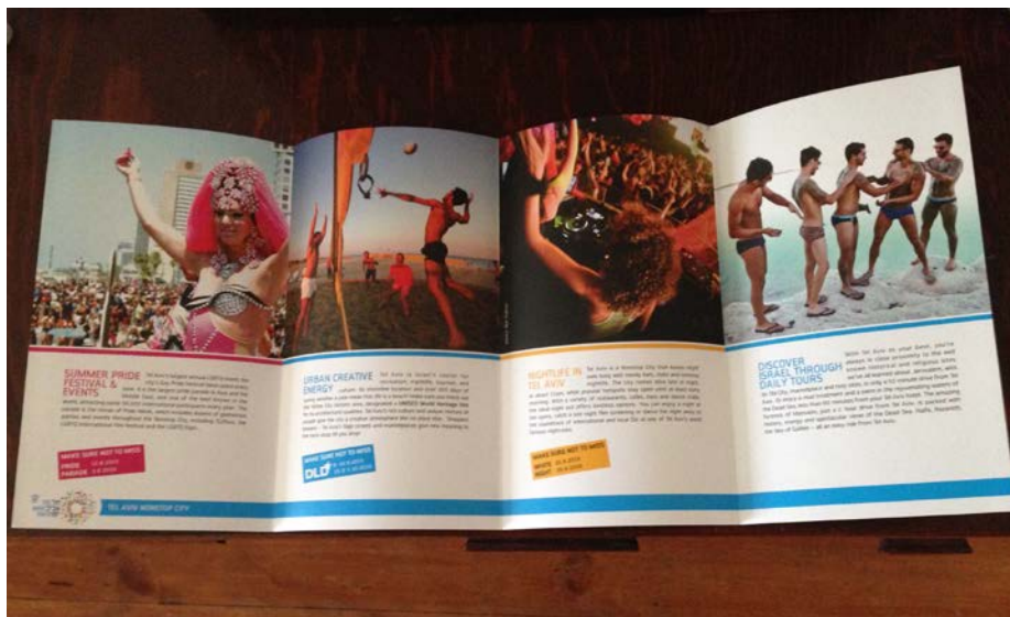
Picture 6. Tel Aviv Gay Vibe leaflet distributed at Stockholm Pride