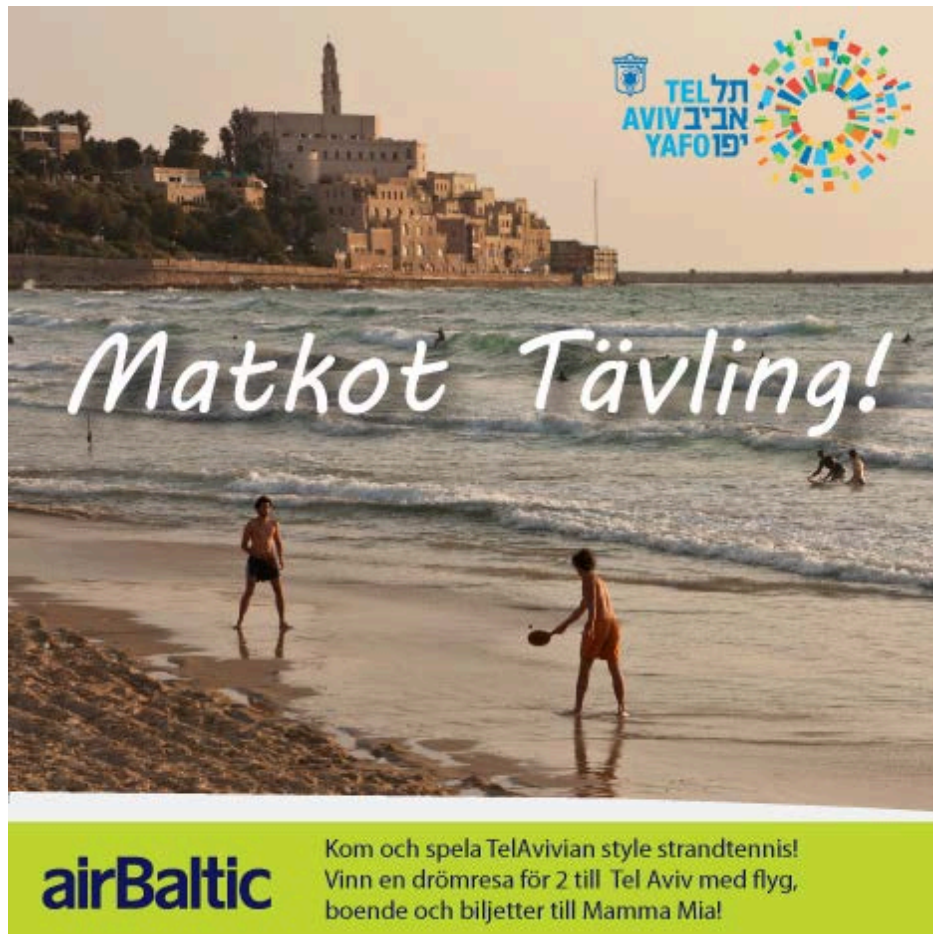
Picture 4. Matkot competition

These globalising tactics notwithstanding, Tel Aviv is “reterritorialised” with the help of particular linguistic and material artifacts. The deck chair and the strip of sand in front of the tent are meant to re-create the feeling of a sunny beach in Tel Aviv in the otherwise chilly and rainy Swedish summer weather. Moreover, as was also advertised by the Israel Government Tourist Office for the Nordic countries on Facebook, the sand is meant for a competition in a type of beach tennis, the winner of which would be awarded “a dream trip for two people to Tel Aviv including flight, accommodation and tickets to [the musical] Mamma Mia” (see Picture 4 below).