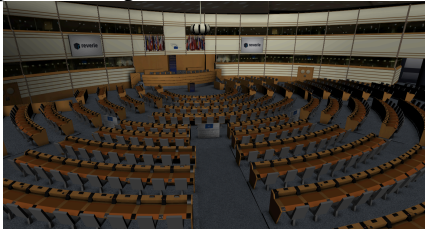
Figure 1: Virtual European Parliament Assembly Chamber

Designing navigation systems intended for multiple users within complex virtual spaces is not a trivial task. The presented system has been developed for such a case, as part of the EC 7 th Framework REVERIE project: REal and Virtual Engagement in Realistic Immersive Environments [1]. The navigation system has been implemented in a REVERIE use case scenario aimed at, but not limited to, the educational sector [2]. Real-world teachers and students can engage as a social group in a virtual educational field trip to a place of cultural significance. The teacher and students are embodied as avatars in a virtual version of the European Parliament Assembly Chamber in Brussels (See Figure 1). Similar to a real-world tour with a personal tour guide, the virtual tour is hosted by a knowledgeable tour guide: a software-driven intelligent virtual autonomous agent. The goal in the presented navigation system is to allow for a mixture of types of movement. This includes via a group of avatars following a leading agent, plus some degree of individual freedom of movement.