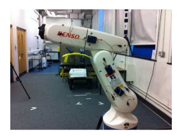
Fig. 1. The configuration of markers on the robot arm that was used on both sides of each segment. The large black boxes contain the batteries and electronics.

The robot arm motion of 130 degrees rotation was recorded during intervals of fifteen seconds. Each marker was moved in a random direction by a distance of 2 cm from the initial reference position in the plane of the body segment. We used a random number generator to derive the random position of sensors within a radius of 2 cm from the center of each joint. The random number generator generates a random angle between 0 and 360 degrees. It also provides a random radius between 0 and 2 cm. In order to control rotation data as much as possible, the movement was restricted to one degree of freedom; that is, the only movement was the rotation of RB1 with respect to RB2 in one fixed plane.