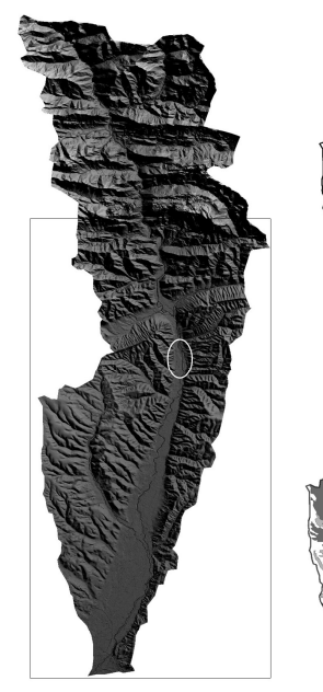
Catchment 10<sup>2</sup>-10<sup>4</sup> km<sup>2</sup>

Figure 1.- Spatial scales considered in the identification of hydromorphological processes and indicators. According to catchment and landscape unit attributes (i.e., size, relief, geology, land cover), different amounts of water and sediments are produced and delivered to the river network. Longitudinal connectivity along river segments determines water and sediment transport downstream. Lateral and vertical dimensions at reach scale govern the predominant pathways of exchange of water and sediments, and the resulting hydromorphological character and functioning of the river system.