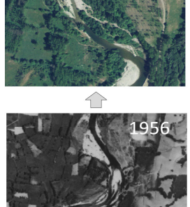
River reach 10<sup>-1</sup>÷10<sup>1</sup> km