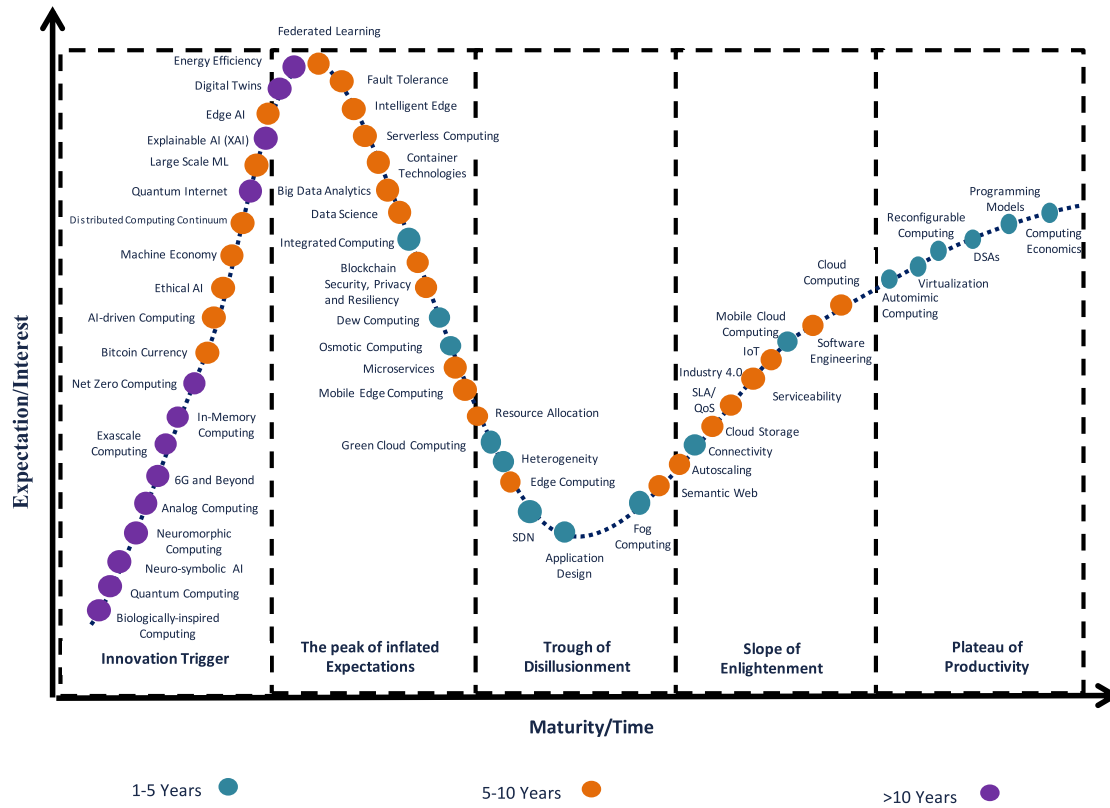
Fig. 2. Hype cycle for modern computing.

Computing, XAI, and the quantum Internet are all expected to be in the spotlight for at least another decade. Digital twins, cybersecurity, edge intelligence, edge computing, and blockchain technology have generated an unprecedented level of excitement. They are expected to be completely built-in under five years with the help of modern technology. Machine Economics, In-Memory Computing, Bitcoin Currency and AIOps/MLOps have all reached their peak of inflated expectations for the following five to ten years of noteworthy evolution. Significant progress needs to be made before biologically inspired computing, neuro-symbolic AI, analog computing, neuromorphic computing, 6G, and quantum computing can be considered hype-worthy. Cloud and fog computing has been trending heavily over the past few years, and that trend could persist for the next five to ten years.