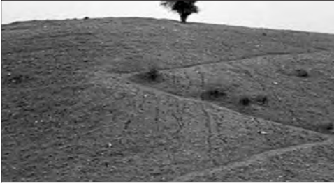
Fig. 1. Where Is the Friend's House? (Abbas Kiarostami, 1987)

the central point of engagement set up by the film: this lies in the visual and spatial organization of the narration of Ahmed's repeated journeys on foot across the open spaces that separate the two villages. Through mise en scène , mobile framing and editing, each journey is mapped in considerable detail, such that the geography becomes as important a protagonist as the boy himself. The signature shot of Where is the Friend's Home? is a strikingly composed image of a zigzag uphill path that marks the start of each of Ahmed's three journeys away from Koker (fig. 1), lending a ritual quality to this exploration of a child's geography: his leaving and rejoining of security, his incessant coming and going, his going exploring beyond a permitted, secure, spatial range. In this single, repeated, image is condensed the very psychodynamics of cultural experience as a negotiation and inhabiting of "spaces between." 21