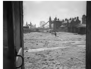
Fig. 2-11. Mandy (Alexander Mackendrick, 1951)