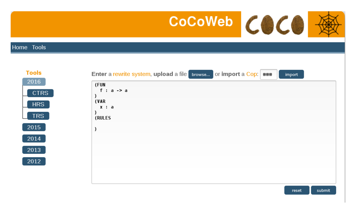
Figure 1: The entry page of CoCoWeb.