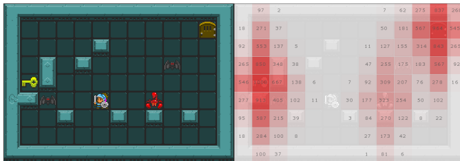
Fig. 2. Value map of the game Zelda after 10 game ticks.

2) Main Algorithm : While the genetic algorithm ensures proper local movement, a heuristic permits the player to look beyond the horizon of simulated sequences. Its purpose is to encourage the urge to explore and getting a sense of which objects are valuable. With the knowledge of each object type's worth, a value map is created by combining each object's corresponding range of influence (see Figure 2). The result is similar to a heat map, with areas of varying attractiveness formed by an especially beneficial object, clusters of many low-valued ones or the presence of threats.