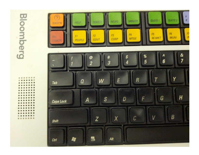
Figure 2. The Bloomberg Terminal keyboard.

The Bloomberg Professional service can be accessed through PCs, tablets, and smartphones, though its most iconic manifestation is through the Bloomberg Terminal, a dual-screen monitor with a fingerprint scanner and specialised, colour-coded keyboard that offers immediate access to areas such as EQUITY, NEWS, COMMODITY, CORP and GOVT. Although art investment has become an important asset class, there is no direct ART key.