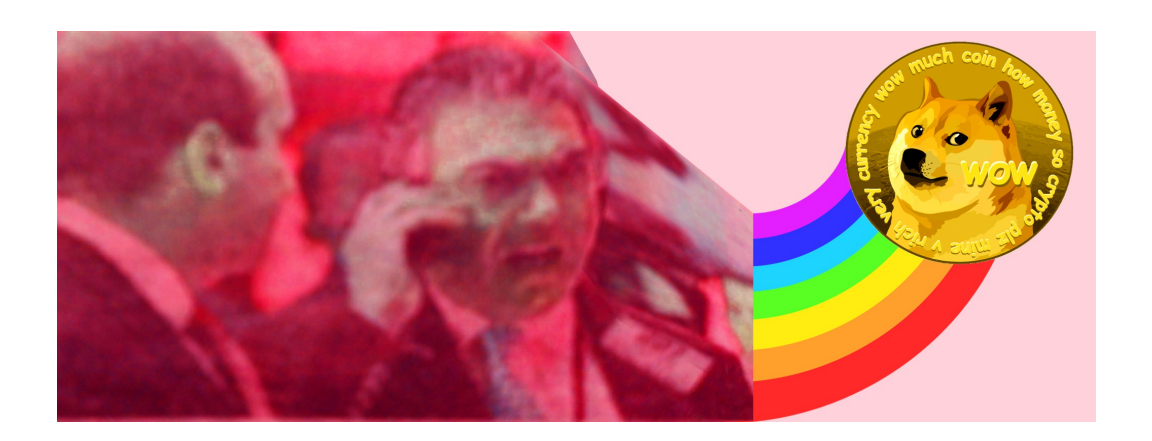
Figure 4. Image from 'Changing the Image of Finance' workshop, 2016.

This process was conceived as a prompt for critical thought, but also as a productive tool to create new images by combining existing ones. These new images provided a basis for conversation with multiple entry points, hooking people into an imaginative process in order to engage them to conduct critical conversations about art and finance.