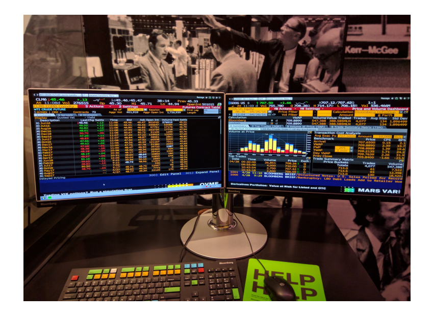
Figure 1. The current Bloomberg Terminal in a dual-screen configuration.

The Bloomberg Terminal, or more accurately, the online data and information services marketed under the banner of Bloomberg Professional, made its initial appearance in December 1982, and has become an enduring, even iconic, tool in the history of computing, to the extent that various models appear in Silicon Valley's Computer History Museum and in the Smithsonian's National Museum of American History (McCracken, 2015).