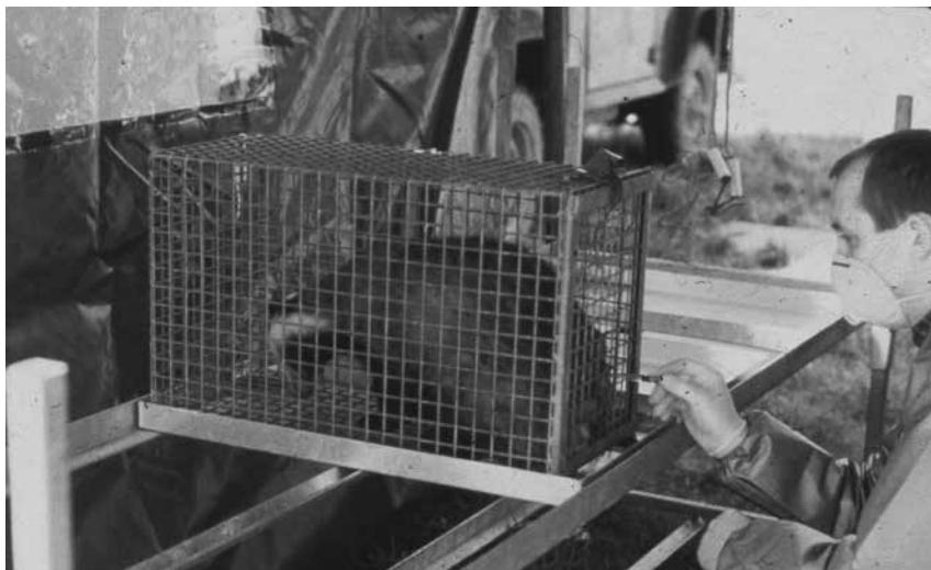
Figure 18: Badger being injected with anaesthetic under field conditions to allow blood sampling and testing for TB as part of the live test strategy

Montague: Just to come back on some of that. It was, I think, even more restricted than that, Mark. It was just the land where infected cattle had grazed, not necessarily the whole farm. So removal activity was focused on a very small part of some farms. In some farms it was the entirety. The live test pilot in the South West again suffered from resource issues. You will appreciate BSE was really focusing our attention at that time. I alluded to the fact that the incidents increased quite dramatically at that time – was it due to perturbation effect from the Dunnet removals? But, of course, the early 1990s is when these new areas just emerged from nowhere, as completely new molecular types. 137 Disease suddenly appeared in Herefordshire and Worcestershire. In Monmouthshire we had disease appear at the end of the 1980s, beginning of the 1990s. It had been clear of TB since 1955 and it has a distinct molecular type. Where had it been all that time? It was occurring in distinct geographical areas in mainly large, closed dairy herds, as closed as