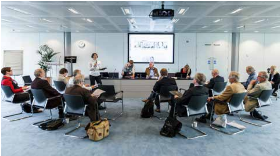
Figure 1: Participants at the Witness Seminar