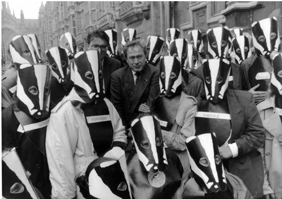
Figure 17: Representatives from Wildlife Trusts with Tony Banks MP, lobbying the House of Commons, July 1990.