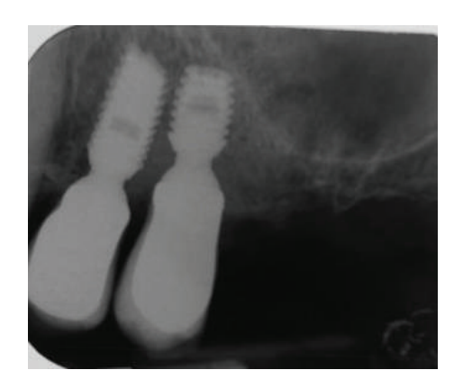
FIGURE 11: Postoperative radiograph indicating complete filling of the peri-implant defect.

After an uneventful healing period of one year, clinical evaluations revealed healthy peri-implant hard and soft tissues (Figures 12 and 13). Two years after procedure, a