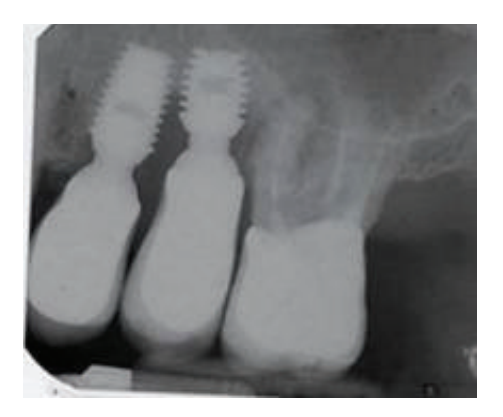
FIGURE 1: The baseline periapical radiograph indicated a deep interproximal peri-implant bone lesion.